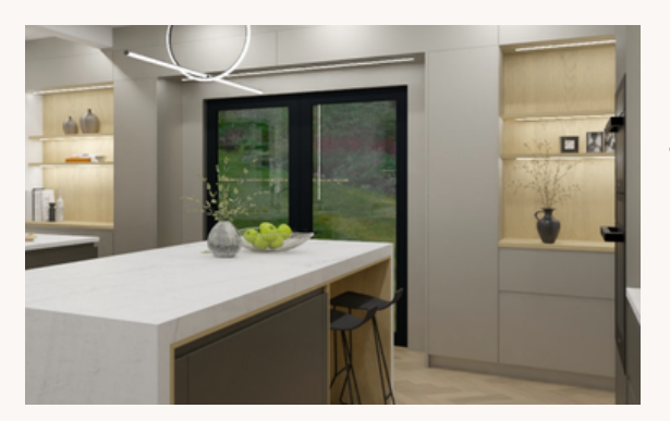
Our latest kitchen design project coming up !

From Novice to Culinary Expert Even if you're not a seasoned chef, modern appliances can help you achieve restaurantquality results. Many ovens now come with pre-programmed cooking settings, making it easy to prepare a variety of dishes. Let's Design Your Dream Kitchen At DFI Interiors, we're passionate about creating beautiful and functional kitchens. We can help you select the perfect appliances to meet your needs and elevate your cooking experience.